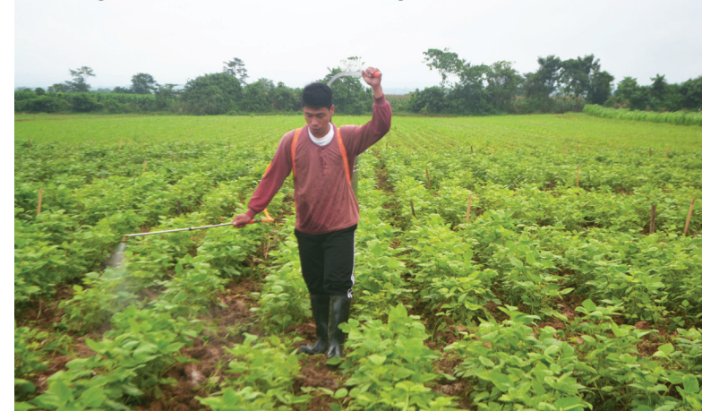
Mungbean plants sprayed with carrageenan PGP

Carrageenan is a polysaccharide extracted from red edible seaweeds. By radiation processing, carrageenan can be modified to be an effective plant growth promoter. Carrageenan PGP contains essential micro and macro nutrients which enhance the crop vigor of rice and other vegetative crops like pechay and mungbean. At even a very small amount, it can increase rice yield by 20 – 30 %.